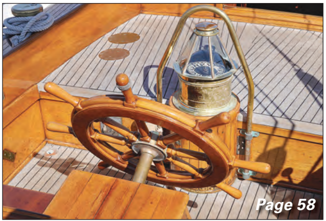
64 What's in a Name? The origins and legacy of the Hampton boat